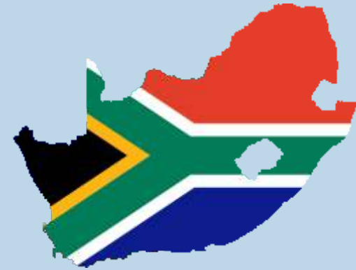
REPUBLIC OF SOUTH AFRICA