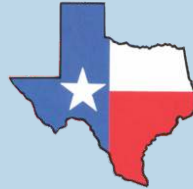
REPUBLIC OF TEXAS